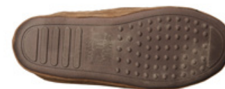
BOTT = 2 shot