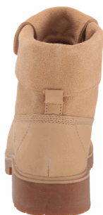
BACK = 4 shot