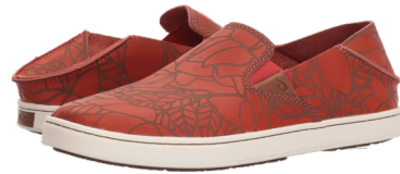
Pair = P shot