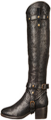
LEFT = 3 shot