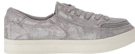
RGHT = 5 shot