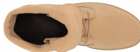
TOPP = 1 shot