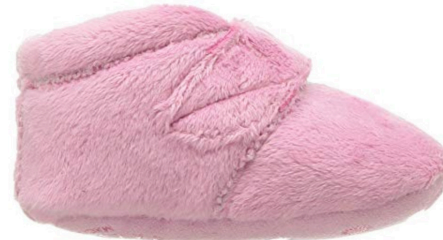
RGHT = 5 shot