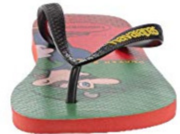
FRNT = 6 shot

The pair shot will be overhead, and if there is a graphic it will be oriented so the graphic can be read.