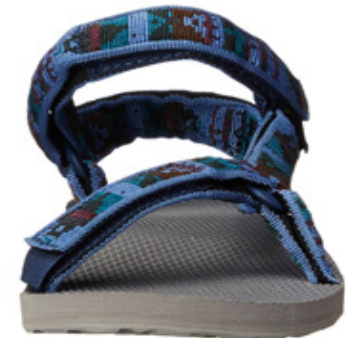
FRNT = 6 shot

Sock will be featured on form in that will be added to the T shot so it can be featured on the 5 shot.