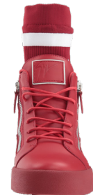
FRNT = 6 shot

The pair shot will feature the boot at both heights