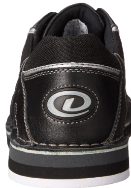
BACK = 4 shot