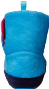
BACK = 4 shot