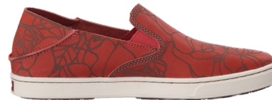
RGHT = 5 shot