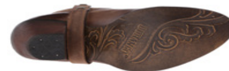
BOTT = 2 shot