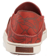
BACK = 4 shot