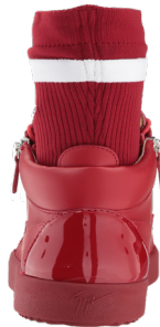
BACK = 4 shot