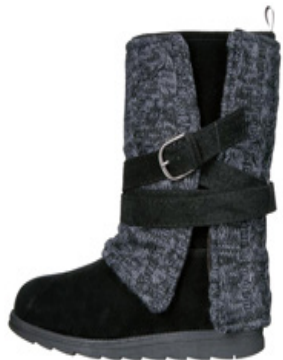
LEFT = 3 shot