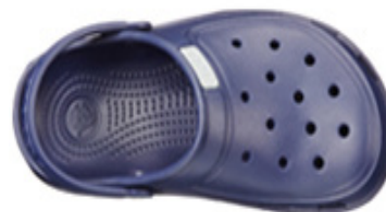
TOPP = 1 shot