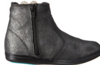
RGHT = 5 shot