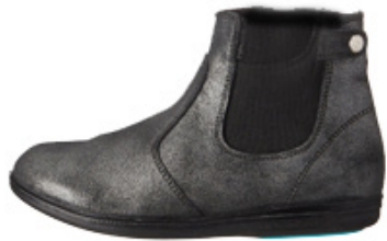
LEFT = 3 shot