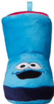
FRNT = 6 shot

Styling deviates at the pair shot where the shoe is reversed.