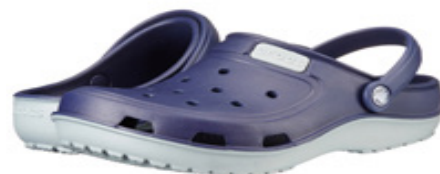
Pair = P shot