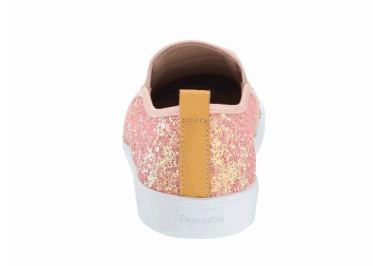
BACK = 4 shot