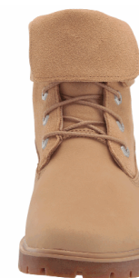
FRNT = 6 shot

The pair shot is where the styling deviates, one boot is folded over and the other is unfolded. Following the pair shot all other images should feature it folded down.