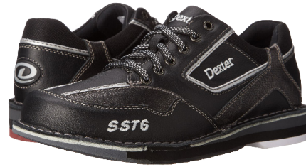
Pair = P shot