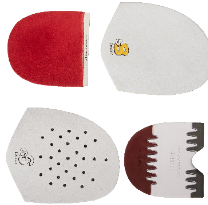
TOPP = 1 shot