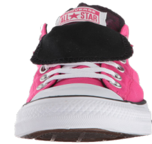
FRNT = 6 shot

The PAIR features the shoe folded up on the RIGHT shoe.