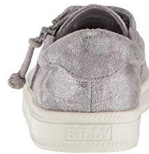
BACK = 4 shot