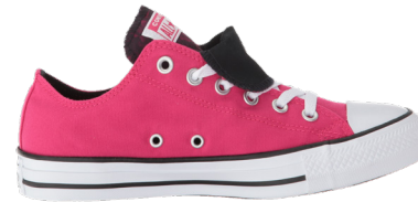
RGHT = 5 shot