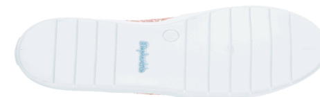
BOTT = 2 shot