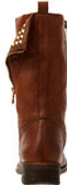
BACK = 4 shot