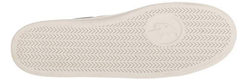
BOTT = 2 shot