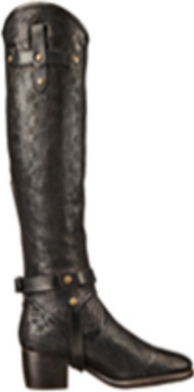
RGHT = 5 shot