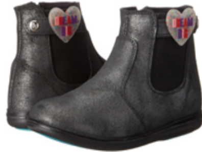
Pair = P shot