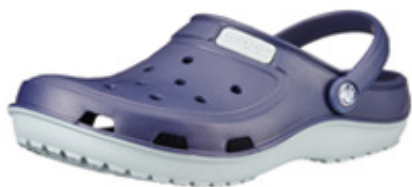
MAIN = t shot