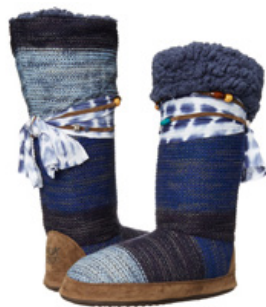
Pair = P shot