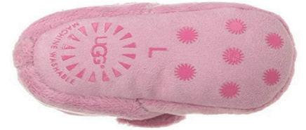
BOTT = 2 shot