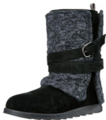
MAIN = t shot