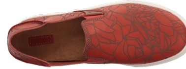
TOPP = 1 shot