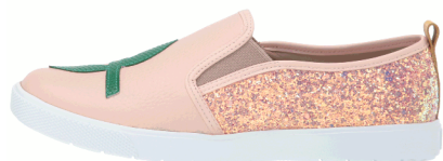
LEFT = 3 shot