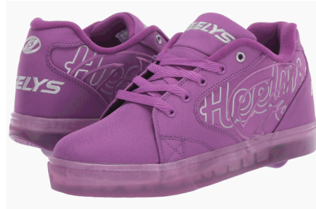
Pair = P shot