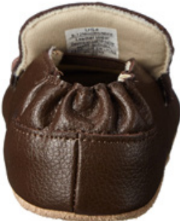
BACK = 4 shot