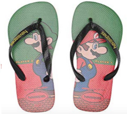
MAIN = t shot