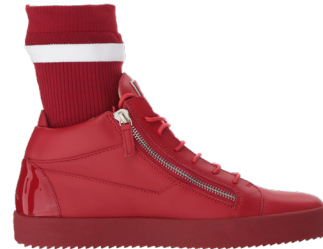
RGHT = 5 shot