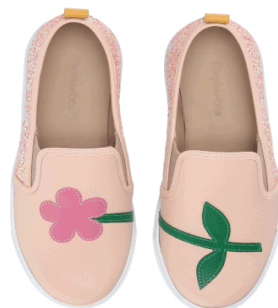
Pair = P shot