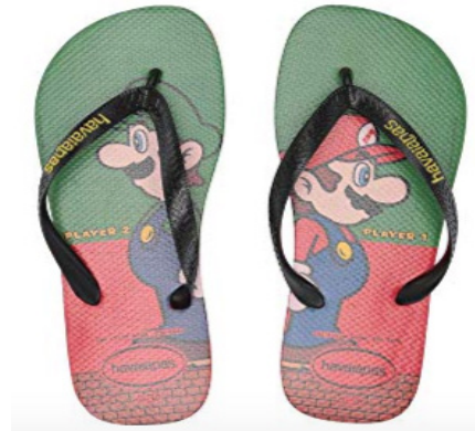
Pair = P shot