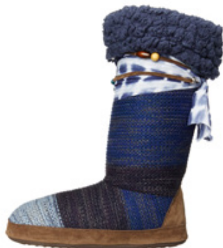
LEFT = 3 shot