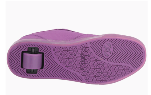
BOTT = 2 shot