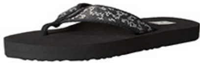
MAIN = t shot