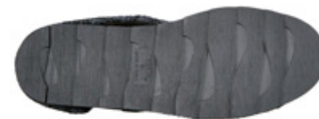
BOTT = 2 shot