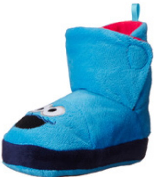
MAIN = t shot