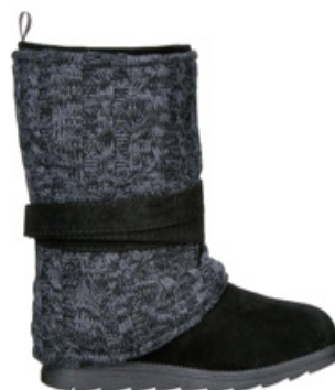
RGHT = 5 shot