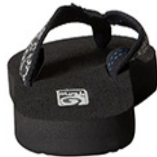
BACK = 4 shot