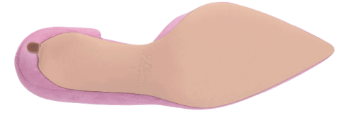
BOTT = 2 shot