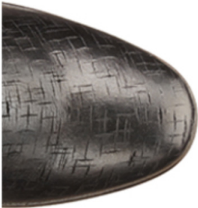
TOPP = 1 shot