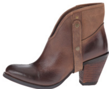
LEFT = 3 shot