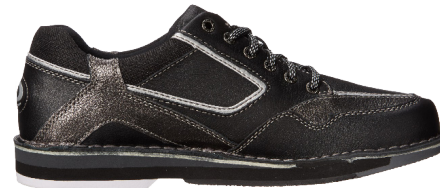
RGHT = 5 shot