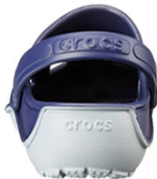
BACK = 4 shot