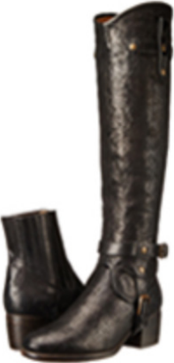
Pair = P shot