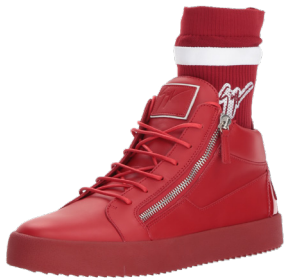
MAIN = t shot