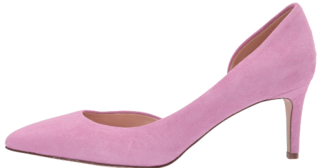
LEFT = 3 shot