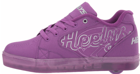
LEFT = 3 shot