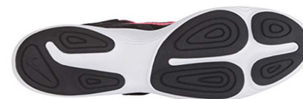
BOTT = 2 shot