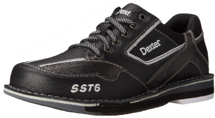
MAIN = t shot