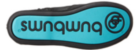
BOTT = 2 shot