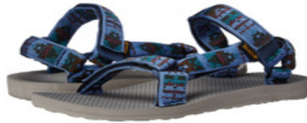
Pair = P shot