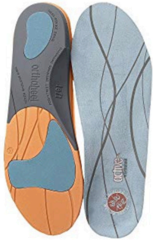
Pair = P shot