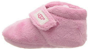
LEFT = 3 shot