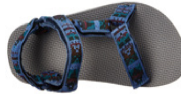
TOPP = 1 shot