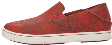
LEFT = 3 shot