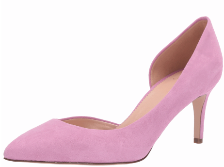
MAIN = t shot