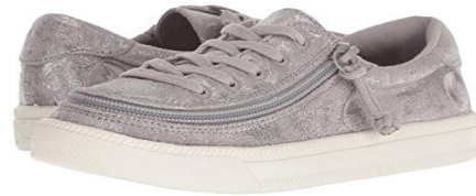
Pair = P shot