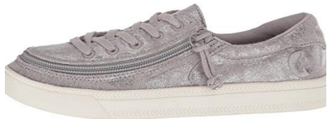
LEFT = 3 shot