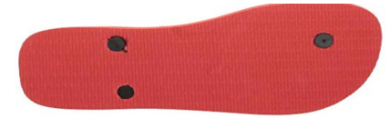
BOTT = 2 shot