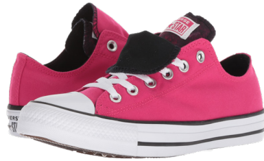
Pair = P shot