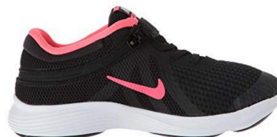
RGHT = 5 shot