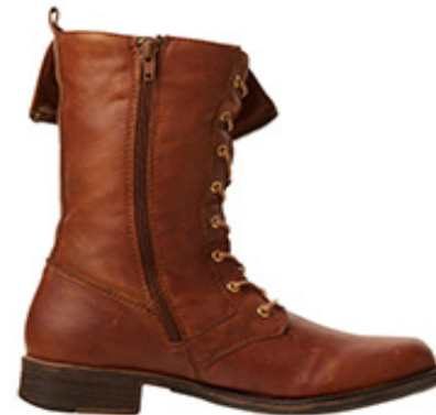
RGHT = 5 shot