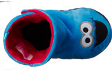
TOPP = 1 shot