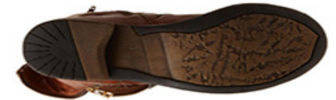
BOTT = 2 shot