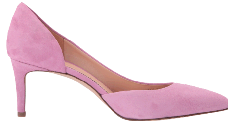
RGHT = 5 shot