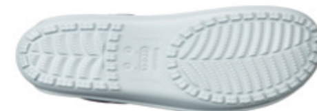
BOTT = 2 shot