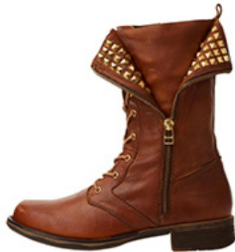
LEFT = 3 shot