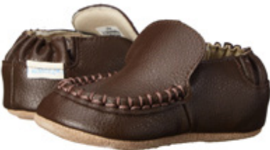
Pair = P shot