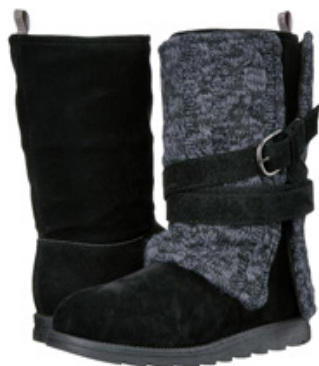
Pair = P shot