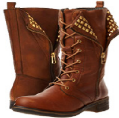
Pair = P shot