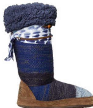
RGHT = 5 shot