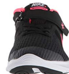
FRNT = 6 shot

These shoes have additional features for an easy to take on/off capabilities. These shoes will be imaged showcasing their adaptive features.