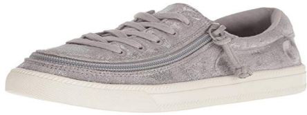
MAIN = t shot