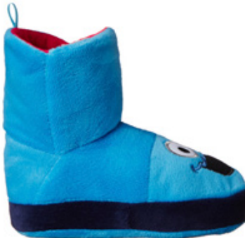
RGHT = 5 shot