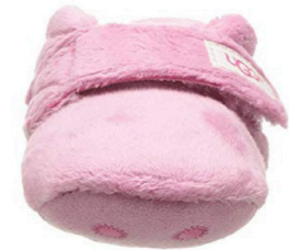
FRNT = 6 shot