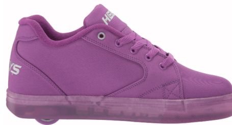
RGHT = 5 shot