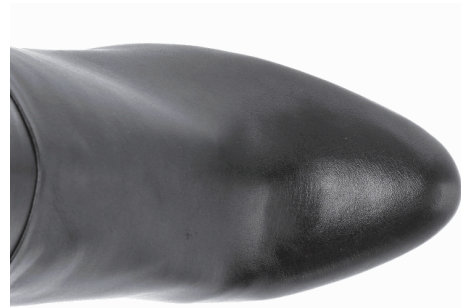
TOPP = 1 shot