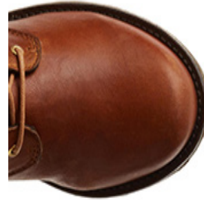
TOPP = 1 shot