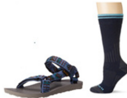
RGHT = 5 shot