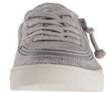
FRNT = 6 shot

These shoes have additional features for an easy to take on/off capabilities. These shoes will be imaged showcasing their adaptive features.