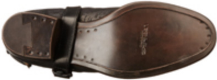
BOTT = 2 shot