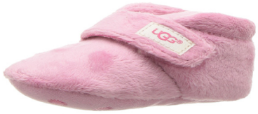
MAIN = t shot