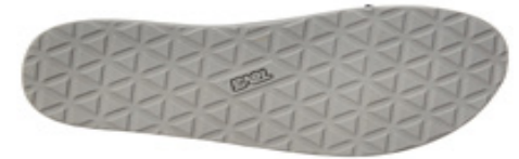
BOTT = 2 shot