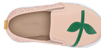
TOPP = 1 shot