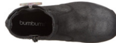
TOPP = 1 shot