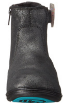
FRNT = 6 shot

The left varriant will feature the shoe without the bauble