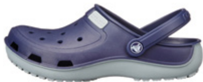
LEFT = 3 shot