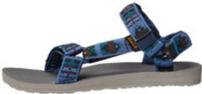
LEFT = 3 shot