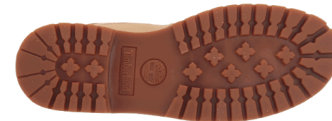
BOTT = 2 shot