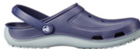
RGHT = 5 shot