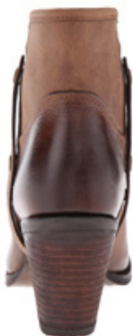
BACK = 4 shot