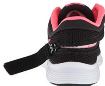
BACK = 4 shot