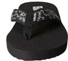
FRNT = 6 shot

These shoes are offered under the same ASIN as one product. The set will be featured P shot with the toes facing downward.