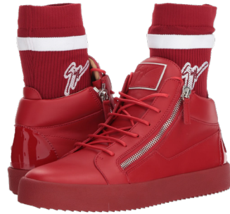
Pair = P shot