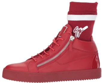
LEFT = 3 shot