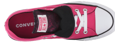
TOPP = 1 shot