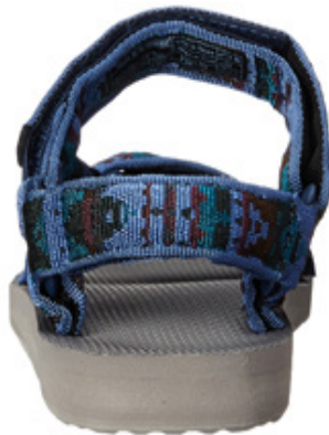
BACK = 4 shot