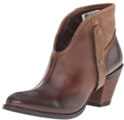
MAIN = t shot