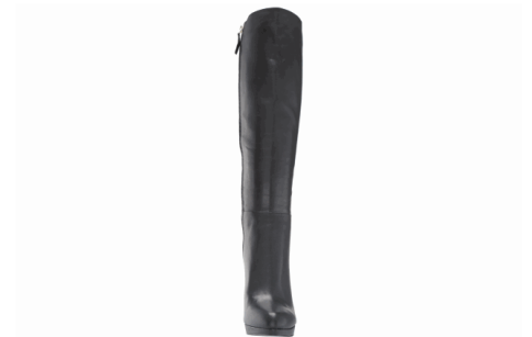
FRNT = 6 shot

Only deviation is that the 1-shot will only showcase the toe of the shoe, simply because the shaft would cover a full view of the toe.