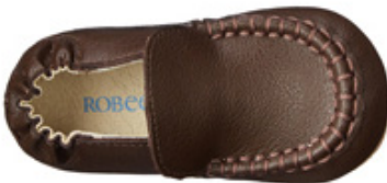
TOPP = 1 shot