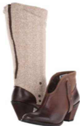
Pair = P shot