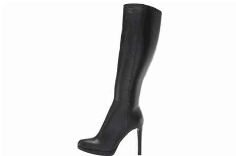
LEFT = 3 shot