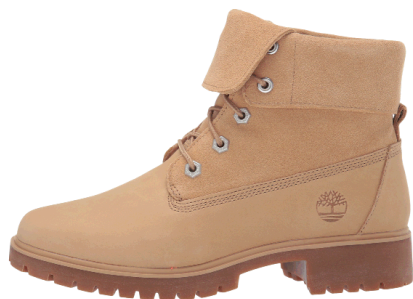
LEFT = 3 shot