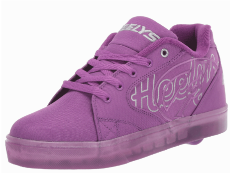
MAIN = t shot