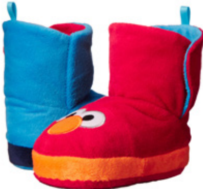
Pair = P shot