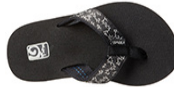
TOPP = 1 shot