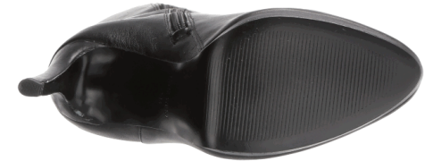
BOTT = 2 shot