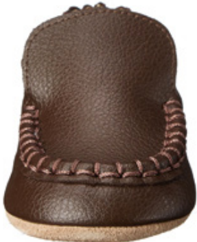
FRNT = 6 shot

Any infant/crib shoes that include a box with a clear display window packaging, plastic pouches and containers should not be considered as display boxes.