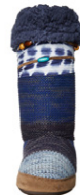
FRNT = 6 shot

The pair shot is where the styling deviates, one boot is folded over and the other is unfolded. Following the pair shot all other images should feature it folded down.