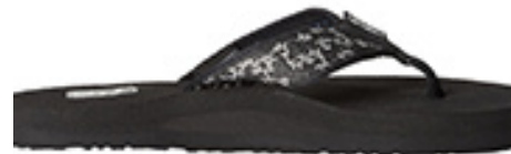
RGHT = 5 shot