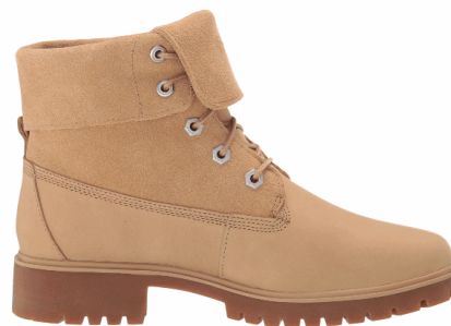
RGHT = 5 shot