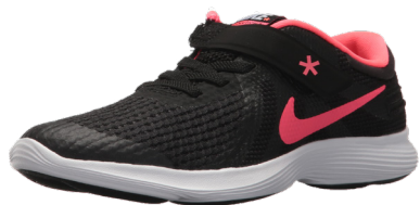
MAIN = t shot