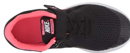
TOPP = 1 shot