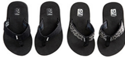
Pair = P shot