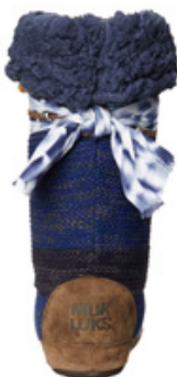
BACK = 4 shot