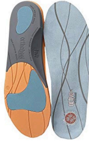
Main= T shot