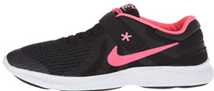
LEFT = 3 shot