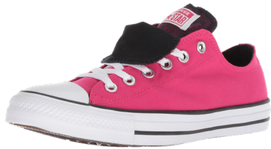
MAIN = t shot