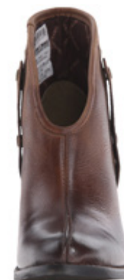
FRNT = 6 shot

The pair shot will feature the boot at both heights and the 5 shot will have the third length attachment.