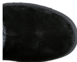
TOPP = 1 shot