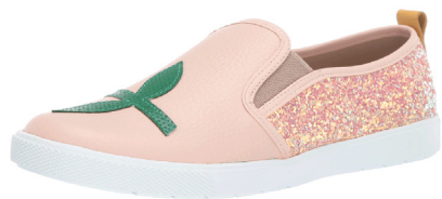
MAIN = t shot