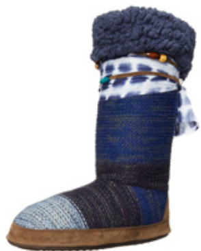
MAIN = t shot