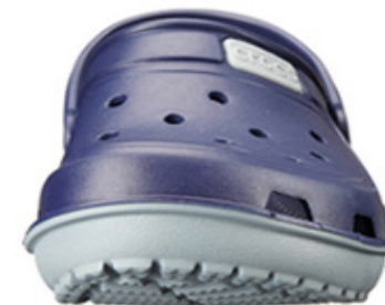
FRNT = 6 shot

Image variants feature strap styled on back heel based on logo orientation on the strap. P-shot features the strap moved forward onto the prod-