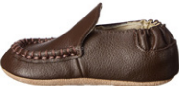
LEFT = 3 shot