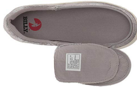
TOPP = 1 shot