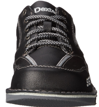
FRNT = 6 shot

Bowling Shoes with Sole Inserts should be imaged with the inserts unattached to the shoe in the .TOPP variant side by side with 1 inch between each insert.