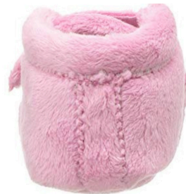
BACK = 4 shot