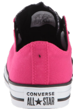
BACK = 4 shot