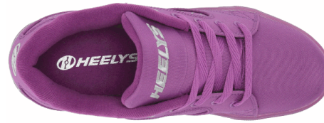
TOPP = 1 shot