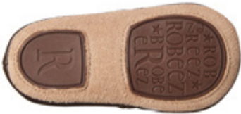
BOTT = 2 shot