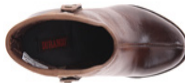
TOPP = 1 shot