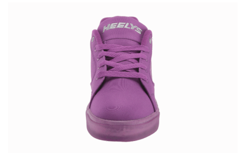
FRNT = 6 shot

Always imaged with the wheel in the shoe