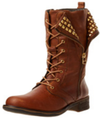
MAIN = t shot