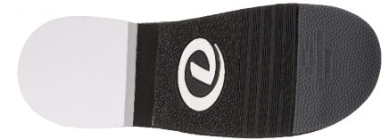
BOTT = 2 shot