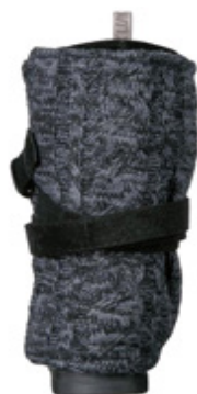
BACK = 4 shot