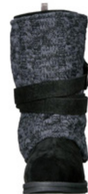
FRNT = 6 shot

The pair shot will feature the boot with both the cover and the cover off