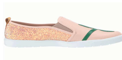
RGHT = 5 shot