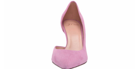
FRNT = 6 shot

This styling will be applied to any shoe without a styling exceptions.. see next slide for What is an Exception?