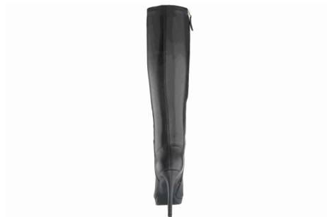
BACK = 4 shot