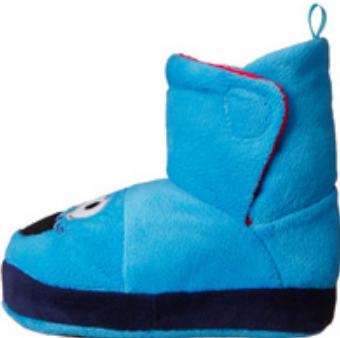
LEFT = 3 shot