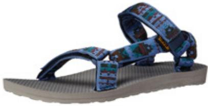
MAIN = t shot