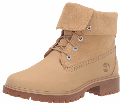
MAIN = t shot