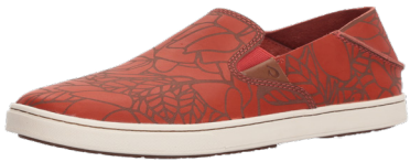
MAIN = t shot