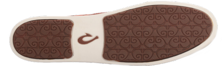
BOTT = 2 shot