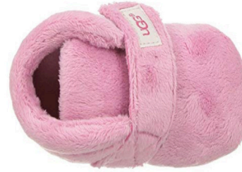
TOPP = 1 shot