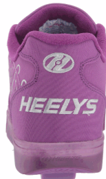
BACK = 4 shot